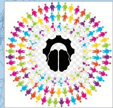
Technology vs. Humanity