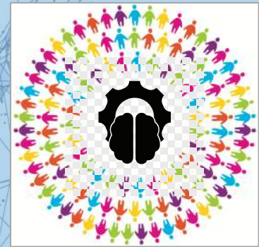
Technology vs. Humanity