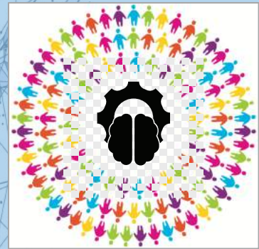
Technology vs. Humanity